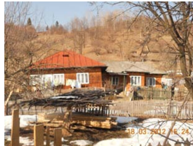
Fig. 13. Building displacement, Grozăvești