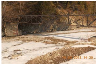
Fig. 14. Poiana Largului hydrometric station on Bolătău brook