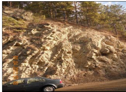
Fig. 8. Strongly folded and tectonized flysch strata near DN 15

The DN 15 national road was constructed on a polygenetic slope modeled in strongly folded and intensely tectonized flysch rocks, in which the alternating strata (sandstones of different hardness, limestone, clays and marls) behave differently in relation to water action and freeze-thaw processes (Fig. 8).