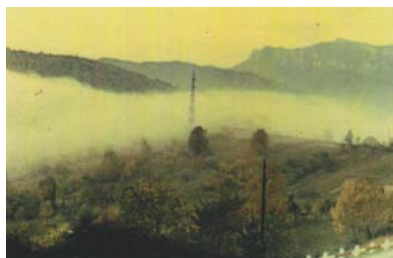
Fig. 17. The evaporation phenomenon in the area of the Ruginești – Potoci reservoir (V. Ciaglic, 1987)

The largest water volume evaporated is registered in the second period of the year, phenomenon accompanied by a high frequency and duration of fog (Fig. 17).