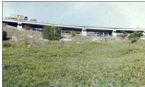
Fig. 10. Viaduct and drains at Grozăvești (Darie)

2. Huiduman catchment , km 258+585 - 258+675. In the same period (1972-1973) the road platform was degraded partially or totally on a length of 90 m. Due to the large depth at which the bedrock is found (8-12 m) was decided that for the crossing of this area a viaduct on Benotto pillars was needed. The viaduct has 6 openings of 15 m (Fig. 10).