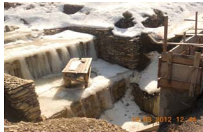
Fig. 15. Flood control works downstream Vârlan brook

At the end of the second decade of February began a period with heavy duration snows which continued up to March. From the second decade of April rainfall came back with even heavier intensity, continuing with small pauses up to June.