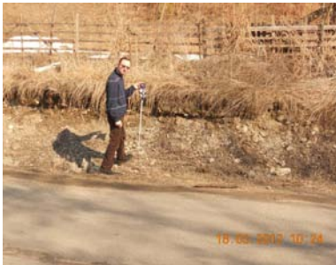
Fig. 12. Subsidence of DN 15 road platform at Grozăvești

In the same period it was noticed that on the road from the dam to Poiana Largu all the brooks were depleted although at the end of the second decade of February 2012 were registered heavy snows (Fig. 14). Immediately downstream Vârlan brook were conducted some flood control works for a small torrent that had affected the road platform (Fig. 15).