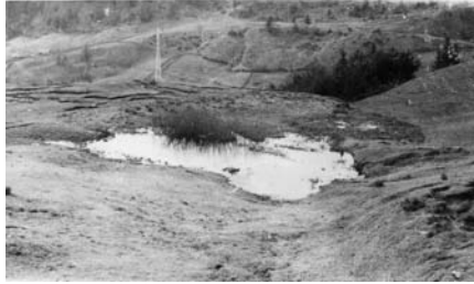
Fig. 2. Landslide area on the left slope of Potoci gulf, 1966

for landslide mitigation: retaining walls, drains for eliminating water excess, Japanese wattleworks. The great majority of these works is functional at the present (Fig. 4).