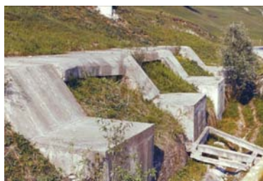
Fig. 7. Anchoring pile arches at the Vale Bubei viaduct