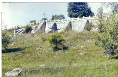
Fig. 6. Consolidation with arches with pilasters on the affected DN 15 at Grozăvești

With all the efforts made for these consolidation works, in only one year from the construction finalization, in 1965, was witnessed the existence on the road of 70 sectors strongly affected by landslides (Fig 6).