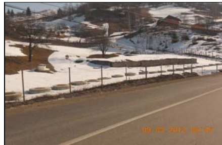
Fig. 11. Drain network on DN 15

The infrastructures anchored in the bedrock (sandstones alternating with marls) are made of piles each on three Benotto pillars. The viaduct was not designed to support the pressure of the whole slope. As in the previous case the viaduct behaved well from the moment it was finished in 1974 up to 1977, when fissures in the pillars and in the strengthening beams occurred. Because the state of the viaduct was not proper for circulation, another one was built upstream it, in parallel taking place the repairing works on the degraded portion. Thus were executed the covering of the broken pillars in steel concrete that reach a depth of 10-12 m from the lower level of the beams. During these works were intercepted springs with a discharge rate of 2-4 l/min which haven't been previously detected in the geotechnical studies. It was considered that the occurrence of the springs has been caused by infiltrations due to a repositioning of the strata after the 1977 earthquake. As a consequence was conducted a work of strengthening the viaduct in the downstream part, with draining caissons buried at 8-9 m from the terrain level, linked between them through a network of drains. The execution of the works has been cumbered by the fact that in the deluvial mass were found large rock blocks which have hardened the positioning of the caissons.