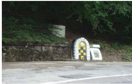
Fig. 4. Consolidation with retaining walls and spring alimeted with water from the drain upstream Motel Cristina