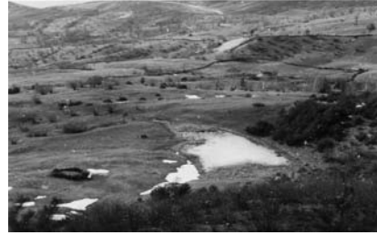
Fig. 3. Area with landslides at Huiduman, 1966