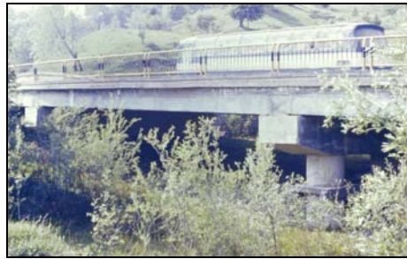
Fig. 9. Valea Bubei viaduct

In 1980, approximately 3 years from the end of the constructions, was witnessed a reactivation of the landslide, which caused the destruction of the canal embankment at the exit from the viaduct.