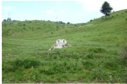
Fig. 5. Drains in an area with landslides and humidity excess

The occurrence of a large reservoir (the lake has at the maximum level 32 km length, 2 km maximum width, a mean depth of 37 meters, surface 3200 ha and a volume of 1230 mil m 3 ) was normally to produce not only a change in the landscape, but also changes in the local natural factors. The construction in the inter-war period of large reservoirs in different countries has offered the possibility to study the influences they have on the neighboring areas. Thus it was seen that the most affected were the climatic factors.