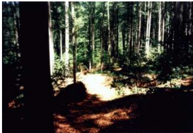
Photo 1. The area of maximum light availability in a clear cut block site (U. P. III u.a. 74B)

The research findings on the light regime in the versions mentioned above are presented below. As can be seen, in the cut block sites there appeared obvious changes of the light regime, generated by the intensity of the logging operations, the size of the cut block sites and the position of each cut block site sector.