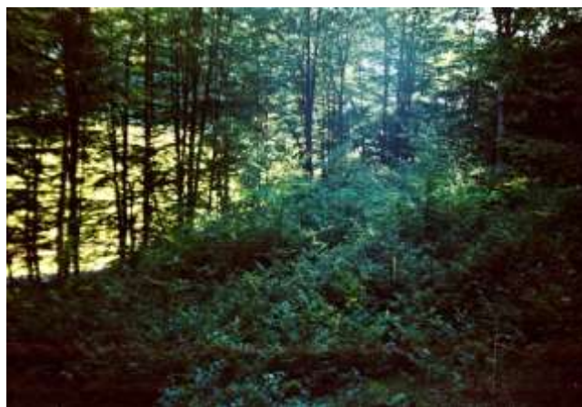
Photo. 2. Elliptical cut block site with installed seedlings (U.P. VI u.a. 127)

Thus, in UP I Chiher, in u.a. 66, a surface with S – E exposure and a 30° slope in a circular cut block site of 0.5 h, created by accident, it can be noticed that about 1/5 of full light reaches the soil surface in the southern and western sectors, 4/5 of full light reaches the central sector and about 4/5 – 1/1 of the light from an unforested area reaches the eastern and northern sectors. When the sky is partially covered with clouds and when the intensity of light in the free atmosphere registers variations, the amount of light that reaches the soil surface undergoes changes.